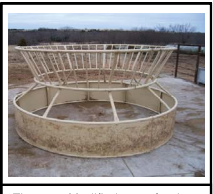
Figure 2. Modified cone feeder.

Both of the Missouri studies and the Oklahoma study indicate that hay waste of low quality forage is clearly greatest with open bottomed feeders compared with cone-type feeders. Using a cone-type feeder may reduce hay waste by as much as 50%. The decrease in wasted hay will more than pay for the additional cost of the cone-type hay feeders.