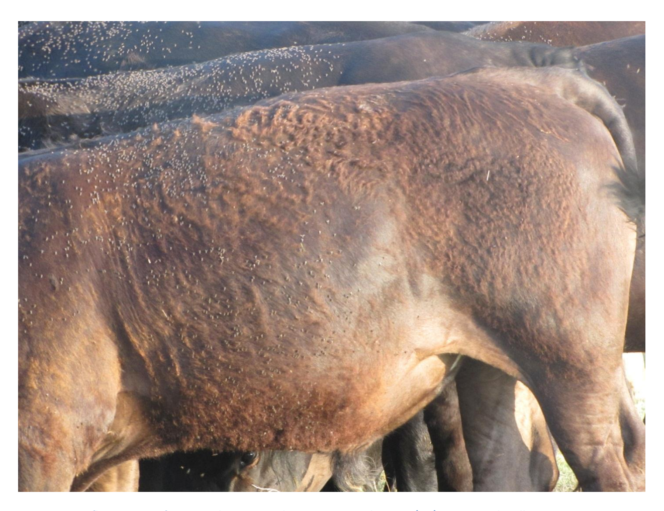
Figure 2: Horn flies on a set of 7 wt. stocker steers. This picture was taken on 7/22/11 near Bartlesville, OK.