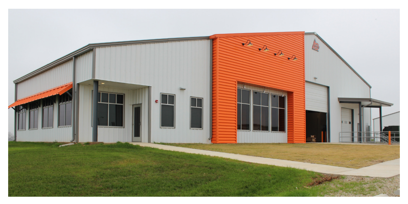
The new facility for the Oklahoma Foundation Seed Stocks has adequate warehouse room and administrative space to accommodate the growing demand for improved plant genetics.